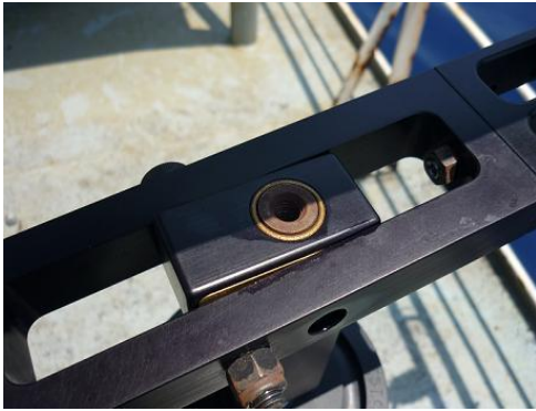
Fig 4: spindle head, “surface rust”