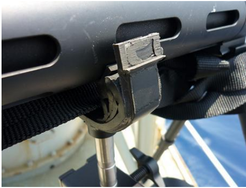
Fig 5: yoke arm