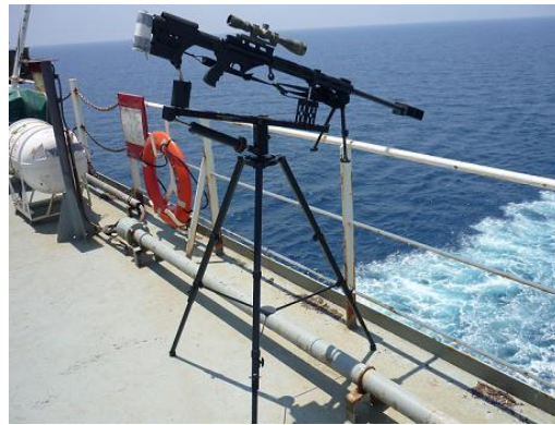
Fig 2.3: .50 cal employment