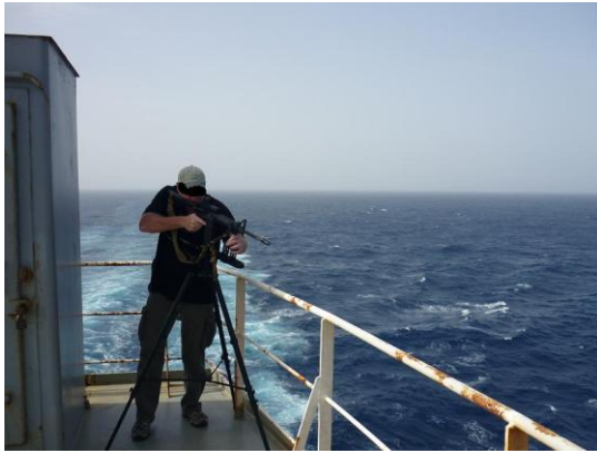
Fig 6.4: standing ready/Spec-Rest™