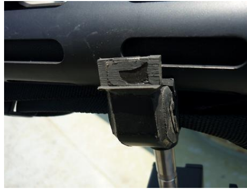
Fig 5.1: yoke arm