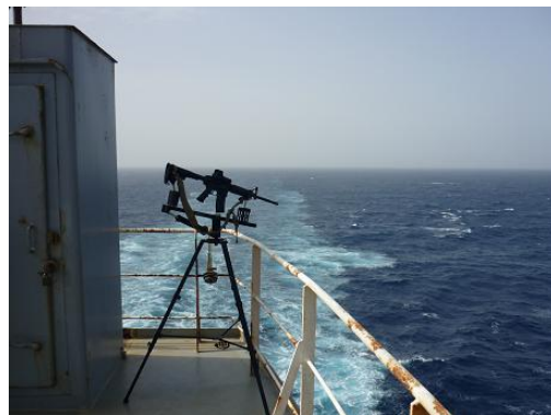
Fig 3.1: M4 on tripod