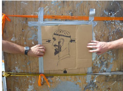
Fig 6.7: target SASR/140 meters