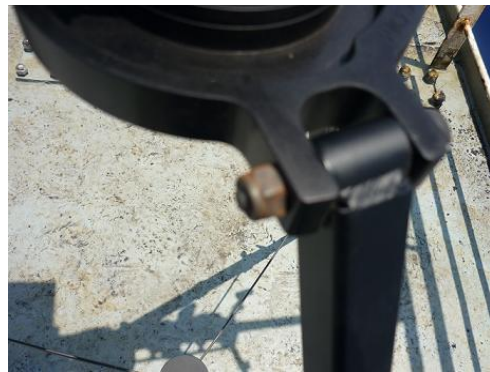
Fig 4.3: Mounting frame