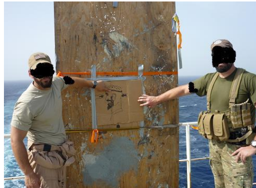
Fig 6.9: target SASR/140 meters