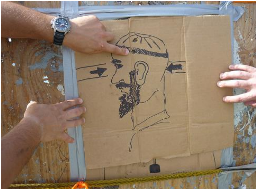
Fig 6.8: target SASR/140 meters