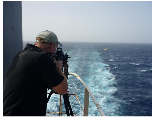
Fig 6.5: standing ready/Spec-Rest™