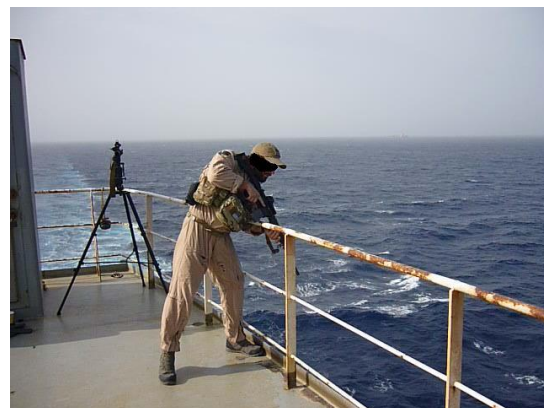
Fig 6.3: standing ready position