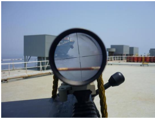
Fig 6.0: digital photo-vessel/1,200 YDS