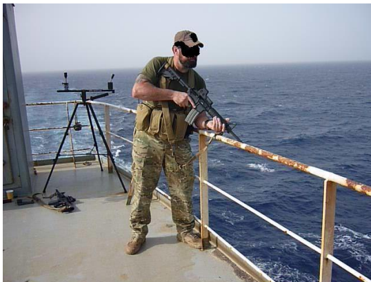
Fig 6.2: standing ready position