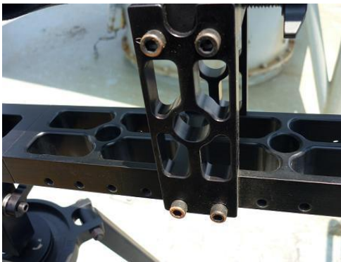
Fig 4.2: Mounting frame