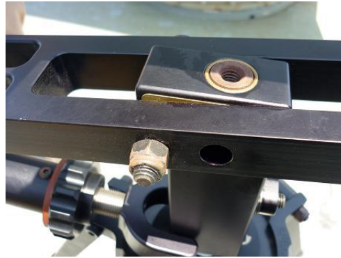
Fig 4.1: spindle head, “surface rust”