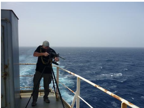
Fig 3: M4 on tripod