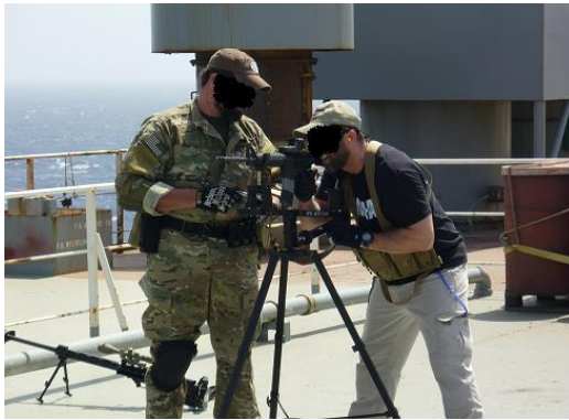
Fig 1: BZO M4 carbine