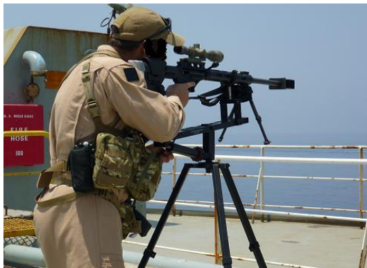
Fig 2: .50 cal employment