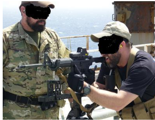
Fig 1.2: BZO M4 carbine