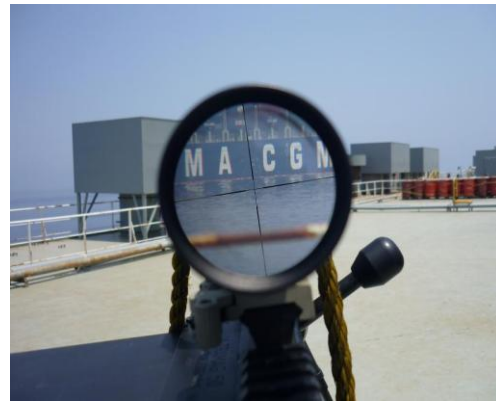
Fig 6.1: digital photo-vessel/1,200 YDS