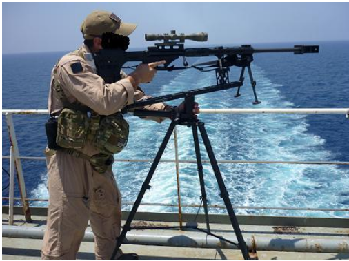
Fig 2.2: .50 cal employment