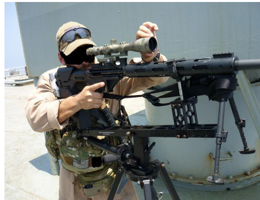
Fig 2.1: .50 cal employment