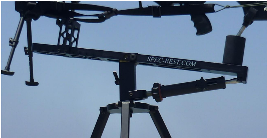
Fig a: Spec-Rest™ “HEAD”

4. During the initial assembly, and while attaching the yoke arm extension to the frame, we found that the powder coating on the parts made it very difficult because of such tight tolerances resulting in having to hammer the yoke assembly pins into place. Compounding this problem, we then attempted to remove the yoke assembly and had to use pliers to remove the pins, as one of them detached from the extension and remained inside of the frame insert holes.